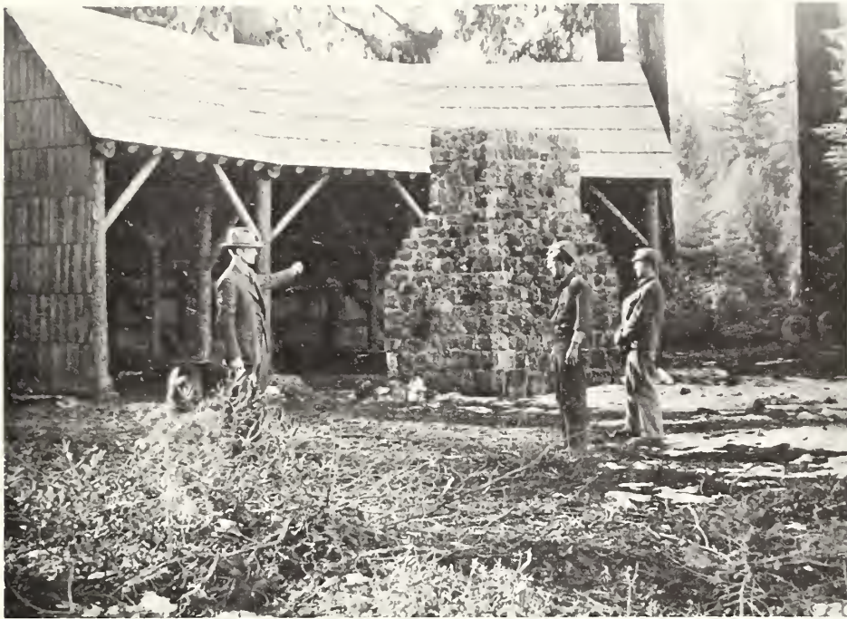
Figure 13. Forest Service Ranger (left) poses with 2 CCC men in front of ski shelter at Union Creek, soon after its completion in 1935. The structure has been destroyed, but the massive stone fireplace remains.

The Forest's CCC sites range from warehouse compounds and ranger station complexes to "community kitchens" and trail shelters. Most administrative structures (including residences) are characterized by knotty-pine interiors, clapboard siding and multi-paned windows.